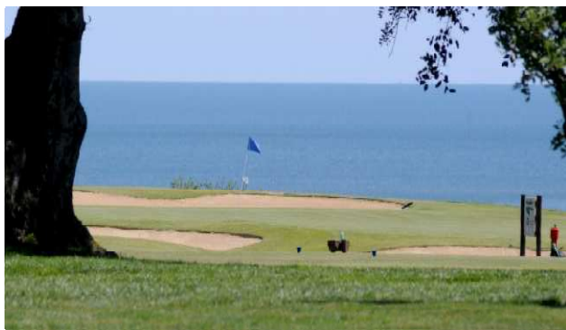
Quinta da Ria